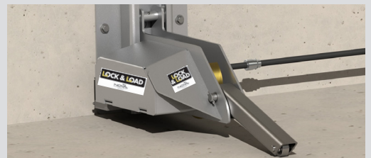
Roller slope extension reduces/eliminates gouging/marking on the dock approach compared to "skid" style slope extensions