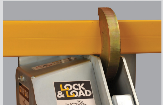
Industry proven truck positioned restraint mechanism