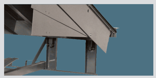
Full width rear hinge in compression with structural channel rear frame supports.