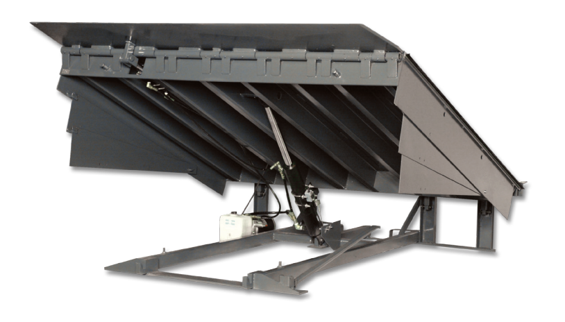
*Shown with structural C & I beam deck support and optional weather seal