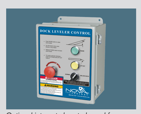
Optional integrated control panel for leveler, restraint, and door. Many other options available.