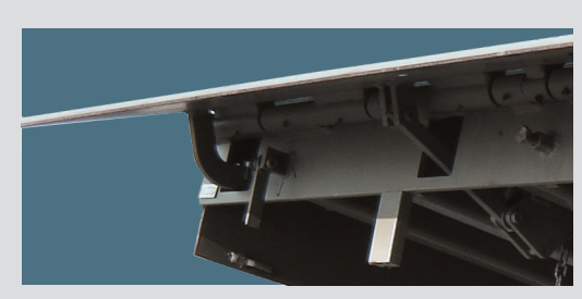
High strength piano hinge construction and lip extension mechanism.