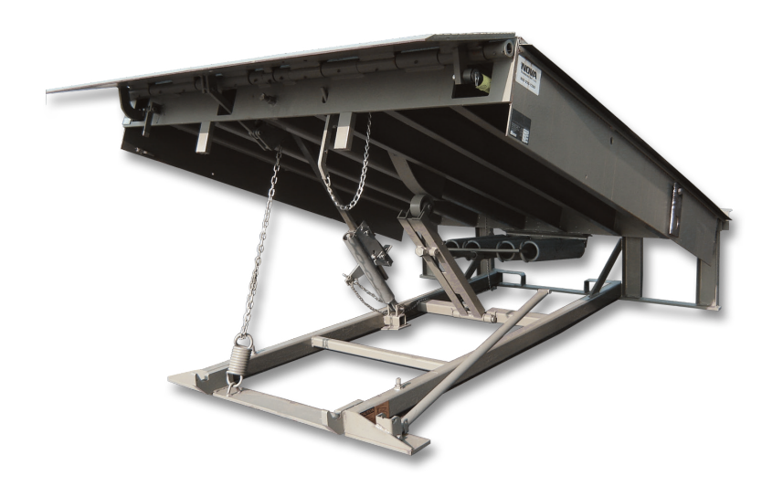
*Shown with structural C & I beam deck support and optional weather seal